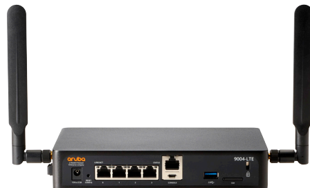
Figure 2. 9004-LTE Gateway